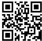
Complete Enrollment Form

FEE IS NON-REFUNDABLE after the first day of class unless Build It Workspace cancels the program due to the minimum enrollment (10 students) not being met. If your child registers late, misses class or withdraws before the end of the session, the full session fees still apply